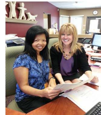
Working together for individual development and organizational excellence.