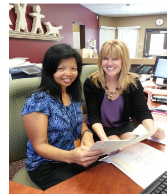
Working together for individual development and organizational excellence.